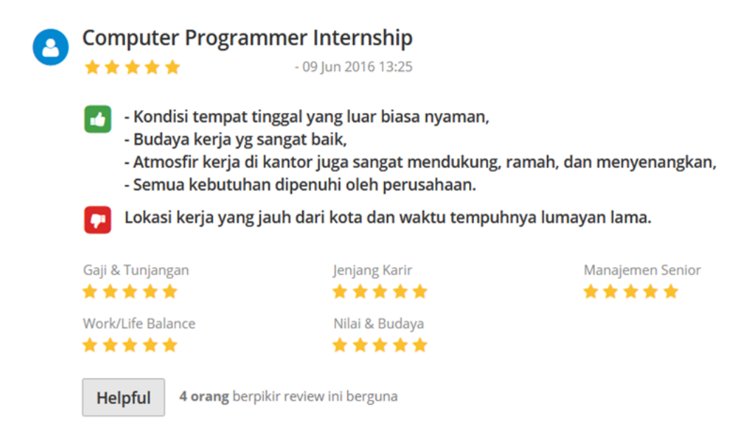
Figure 1. Example of Online Collaborative Review on Employment Website

Online collaborative company reviews will have better information compared to reviews that only one person provides. Two things that are the main reasons the information obtained from online reviews can be trusted are the reviewer's credibility and objectivity (Moriuchi, 2018). This phenomenon is why online collaborative company reviews are more trusted than other online reviews available on the internet. Many employment websites such as Jobstreet, Qerja, and Glassdoor provide this online collaborative company review. The employment website offers a platform where former and current employees can provide reviews and helpful information for job seekers. Diverse sources from various company positions make online collaborative company reviews have miscellaneous information and help job seekers. An example of an online collaborative company review can be seen in Figure 1.