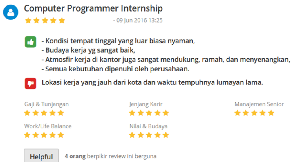
Figure 1. Example of Online Collaborative Review on Employment Website

Online reviews can become a great source of information for job seekers to know where they will work. A job worker needs precise data and information to decide where they should work (Reamer, 2016). One source of information currently sought after and utilized by many job seekers is company reviews available on online platforms. This online company review can be found on multiple news websites, job websites, and social media. In addition, this online company review contains some information that can be used as a reference by job seekers, such as working conditions, salary, and overall rating for a company. Easiness of access has become the main reason for the rise of online company reviews by job seekers.