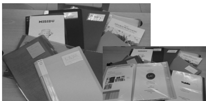
Figure 2: Physical evidence of participative observation

Picture 1 portrayed the process of a semi-structured in depth interview to some informant of the research. As for the participative observation was documented in the archive of consultations or guidance for each business project that were done by the students themselves (Picture 2).