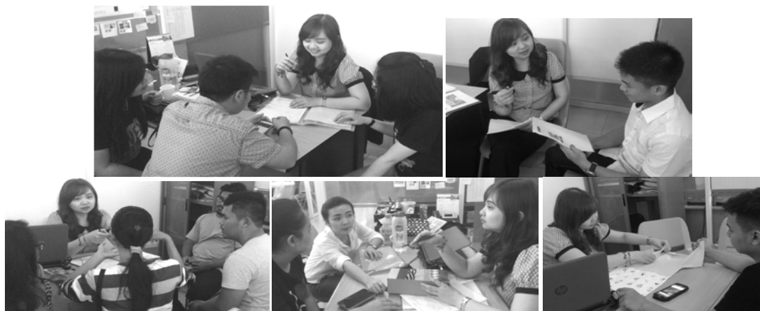
Figure 1: Documentation during in depth interview

Data in the form of documentations obtained during in depth interview to dig more informations from the informant is shown in Picture 1 as follows;